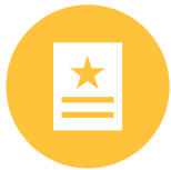
CERTIFICATES & CREDENTIALING

Learn more: dlr.sd.gov/workforce_services/individuals/training_opportunities/default.aspx