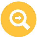
JOB SEEKING SKILLS